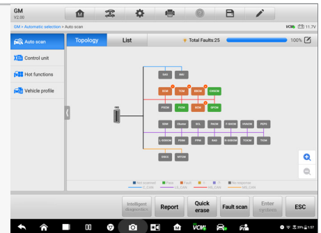
SUPPORTED ON EQUIPPED VEHICLES